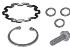
Includes: Coil Retaining Ring (1), Pulley Retaining Ring (1), Shaft Bolt (1), Shim (0.20mm) (1), Shim (0.38mm) (1), Shim (0.51mm) (1).