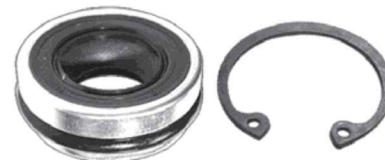
Includes: Retaining Ring (1), Lip Seal (1)